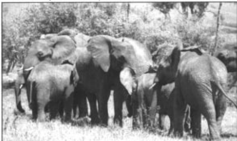
This is no zoo. A wild African elephant herd was one of the exciting sights the VOSH participants enjoyed.