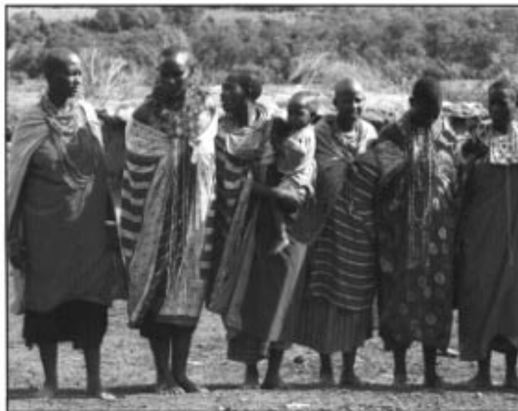
You will meet some wonderful people on a VOSH Mission.

Our group will be returning to Honduras in February 2002 working in a village near the Mayan Ruins at Copan.