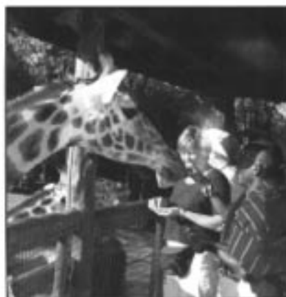
Feeding Giraffes at eye level!